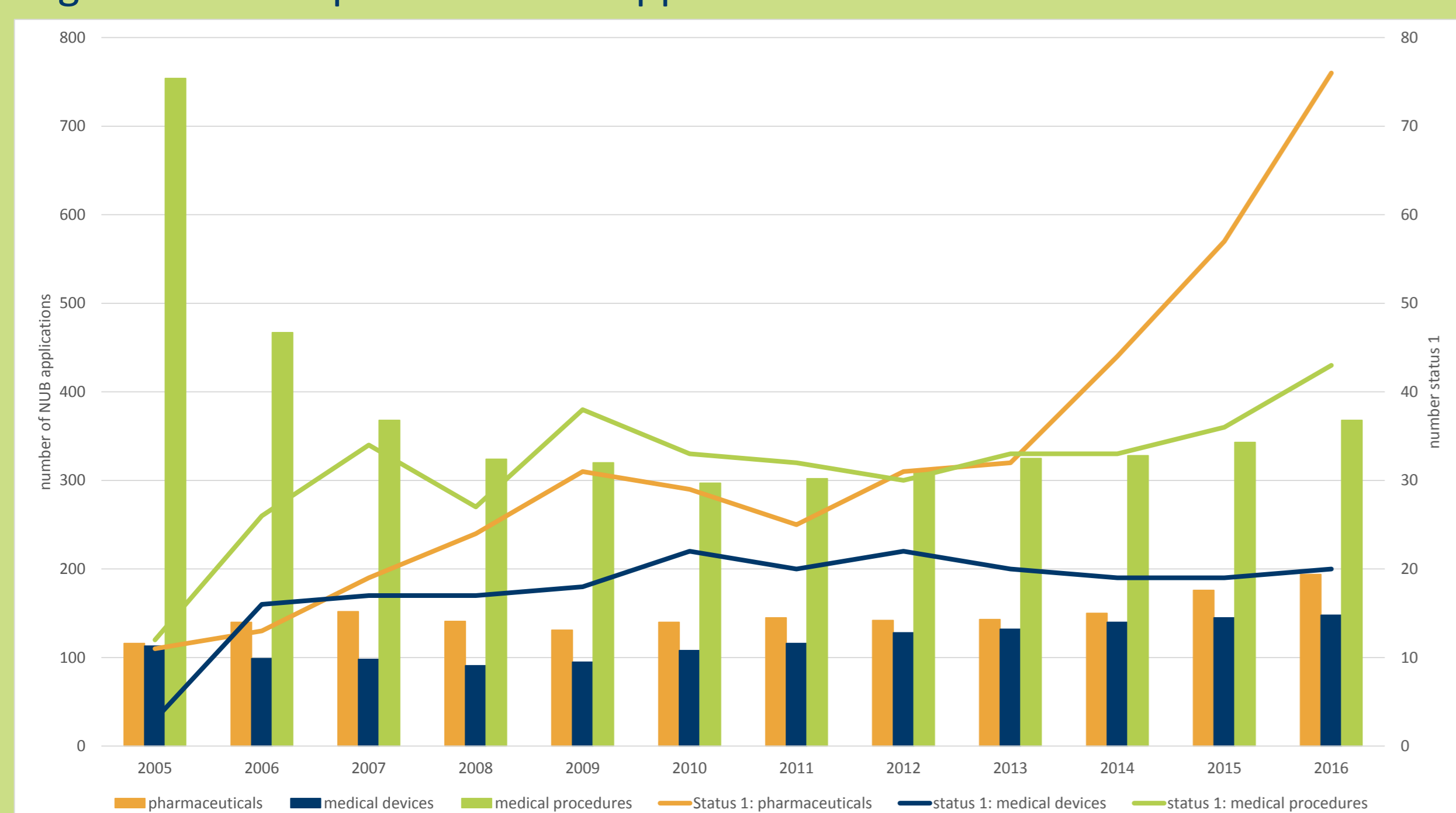
Figure 1: Development of NUB applications and status 1

Annually German publicly funded hospitals are allowed to submit applications for new examination and treatment methods which are (from hospitals' point of view) not appropriately compensated by the G-DRG system. Since implementation overall 186,399 individual NUB applications were submitted to InEK. This figure compiles from 3,028 methods divided into pharmaceuticals, medical devices and procedures. Figure 1 illustrates the annual development of NUB applications and the number of methods assessed with status 1, differentiated by the types given above.